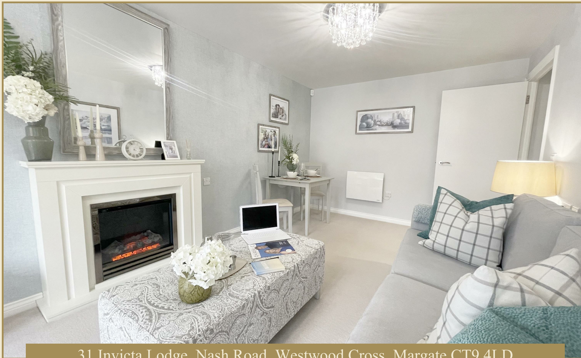
31 Invicta Lodge, Nash Road, Westwood Cross, Margate CT9 4LD